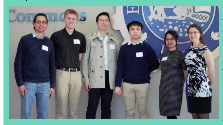
Mixer organizing team

Annual Student-Industry Mixer is the flagship event hosted by ITEUA. The Mixer offers a platform for direct interaction between the industry representatives and students. Students from any discipline at any point in their educational careers are able to mingle with professionals from the transportation industry in a relaxed setting. This helps students connect with professionals from the industry while also assisting them in developing their interpersonal skills.