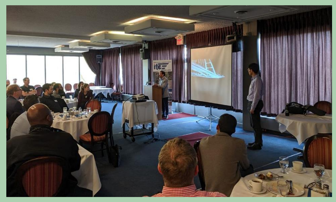
NACITE Luncheon at University of Alberta