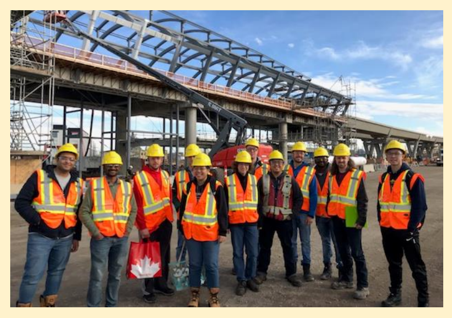
ITEUA members at the technical tour

The full schedule arranged with TransEd would make 4 separate stops along the alignment, highlighting major landmarks such as the Tawatinâ Bridge over the North Saskatchewan River and the elevated Davies Station, shown in the included picture. The other major organizing challenge was determining number of attendees. Initially receiving interest from 19 (plus executive), determining the timeslot for a variety of student demographics was difficult. In the end, we received 10 participants, plus 2 executives. This event was an amazing opportunity for students to directly observe the details and complexity of LRT construction projects.